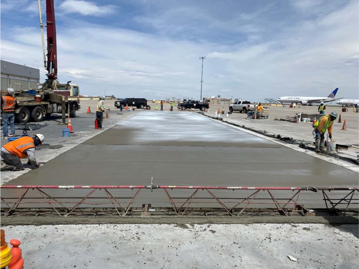
Figure 4 Finishing the 5-panel concrete replacement on United Airlines maintenance hangar apron