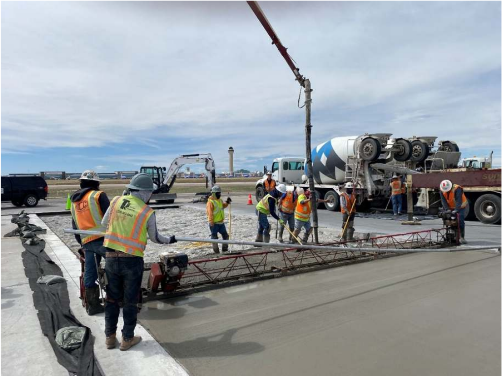
Figure 3 Pouring the replacement concrete panel on United Airlines maintenance hangar apron