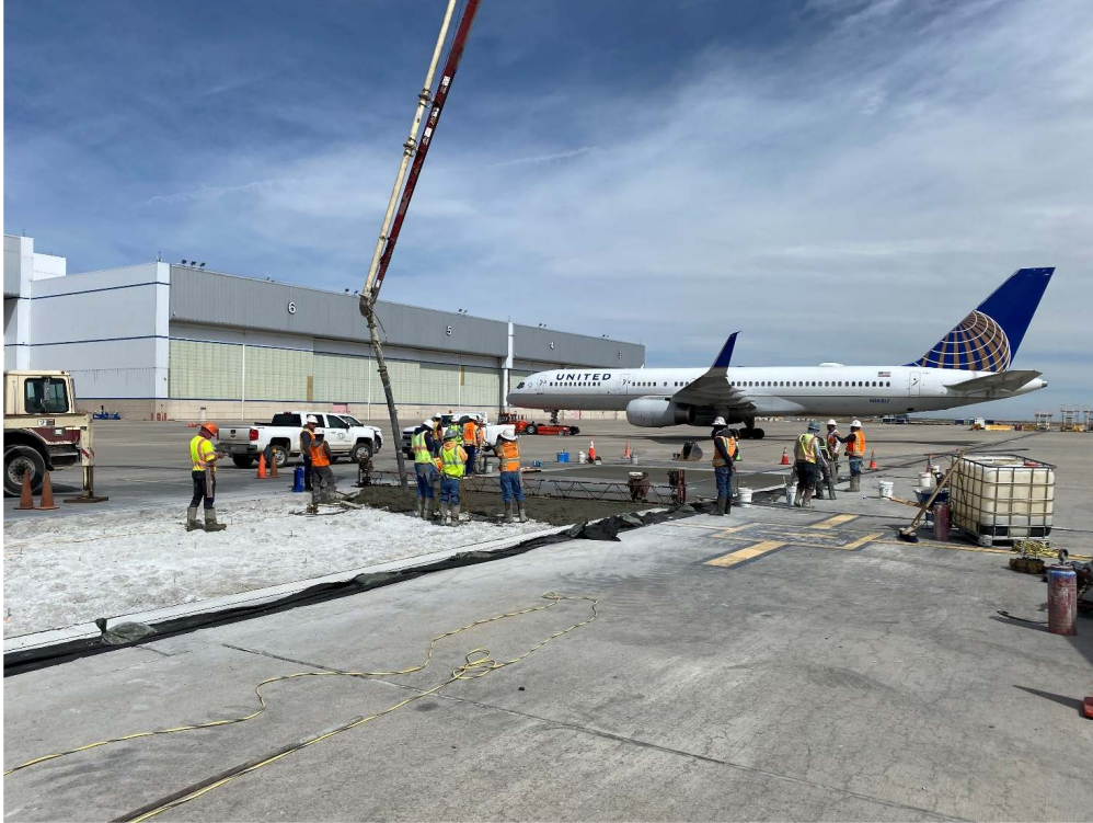
Figure 1 Replacement of first concrete panel on United Airlines maintenance hangar apron.

Both the General Contractor and the Contractor have shared that they are very happy with the performance of EdenCrete® to date and the benefits it provides. There are several more of these panels that will be replaced this year and in the future. Currently the General Contractor has said that there is a high probability, that EdenCrete® will be specified in the remaining placements at Denver International Airport, however the timing and total yardage is unknown at this time. With this pending success, there are additional opportunities that could be available with other airlines and Denver International Airport itself, as well as other airports.