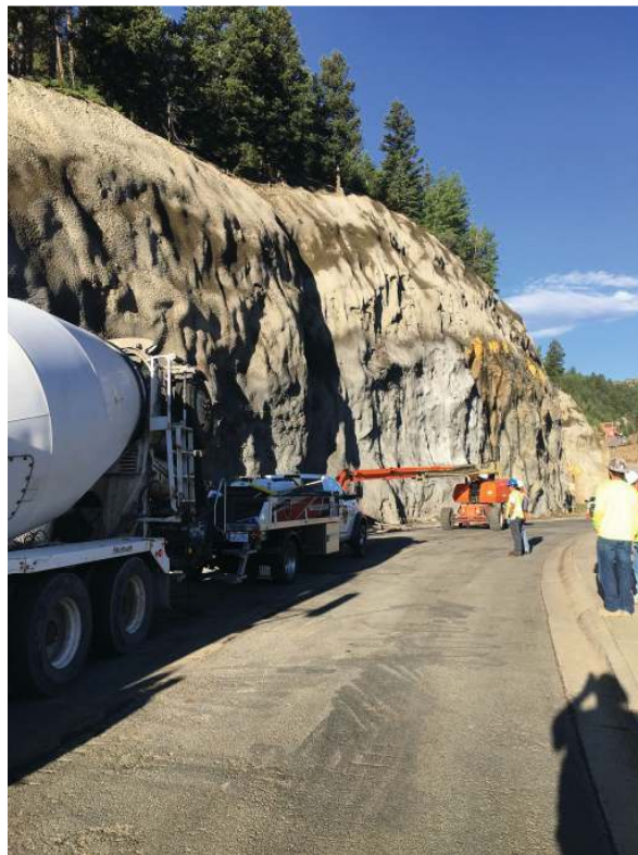
Figure 4. Road-cut stability