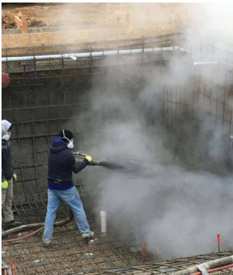
Figure1 Shotcrete trial without added EdenCrete®