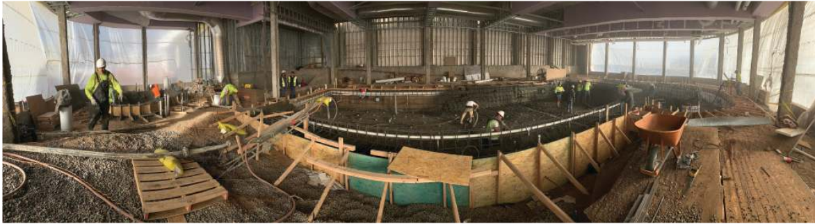
Figure 5. Concrete vertical structures