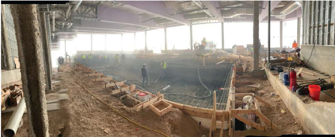
Figure 6. Concrete swimming pools