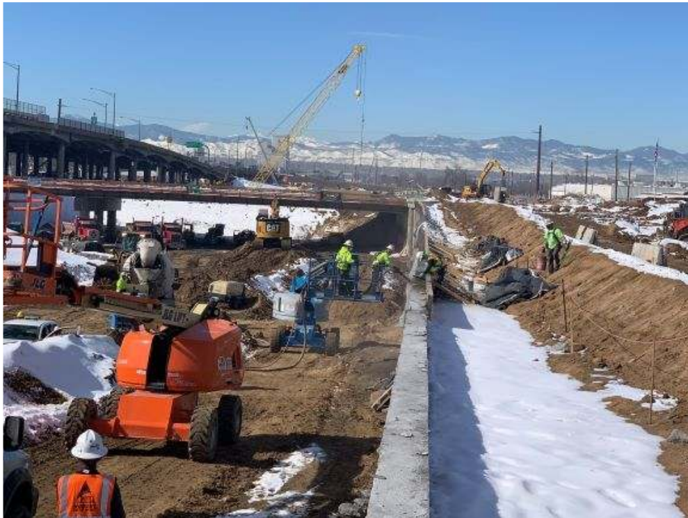
Figure 9. Retaining wall being constructed along Central 70 project using EdenCrete® shotcrete