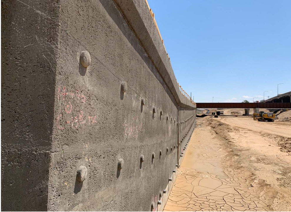
Figure 8. Retaining wall along Central 70 project constructed using EdenCrete® shotcrete.

An indication of the size and importance of this project, which has now been ongoing for more than 20 months, can be gained from Figures 8-10 which are all from the Central 70 Project on the I-70 in Denver Colorado.