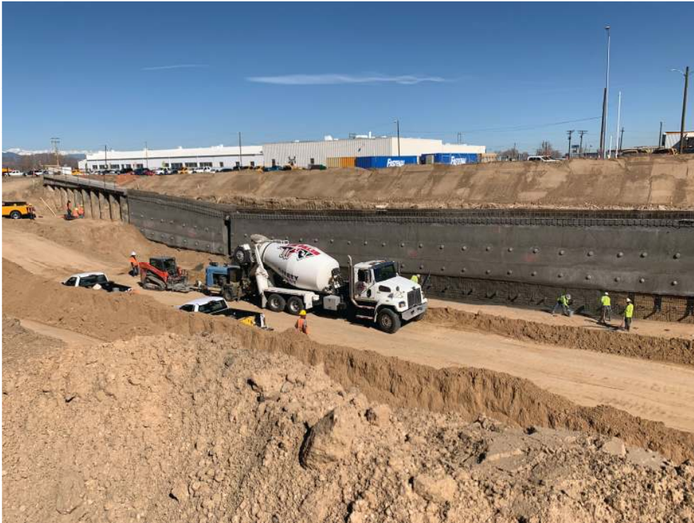
Figure 3. Re-inforcement and buttressing – Central 70 Project - I-70 Denver Colorado