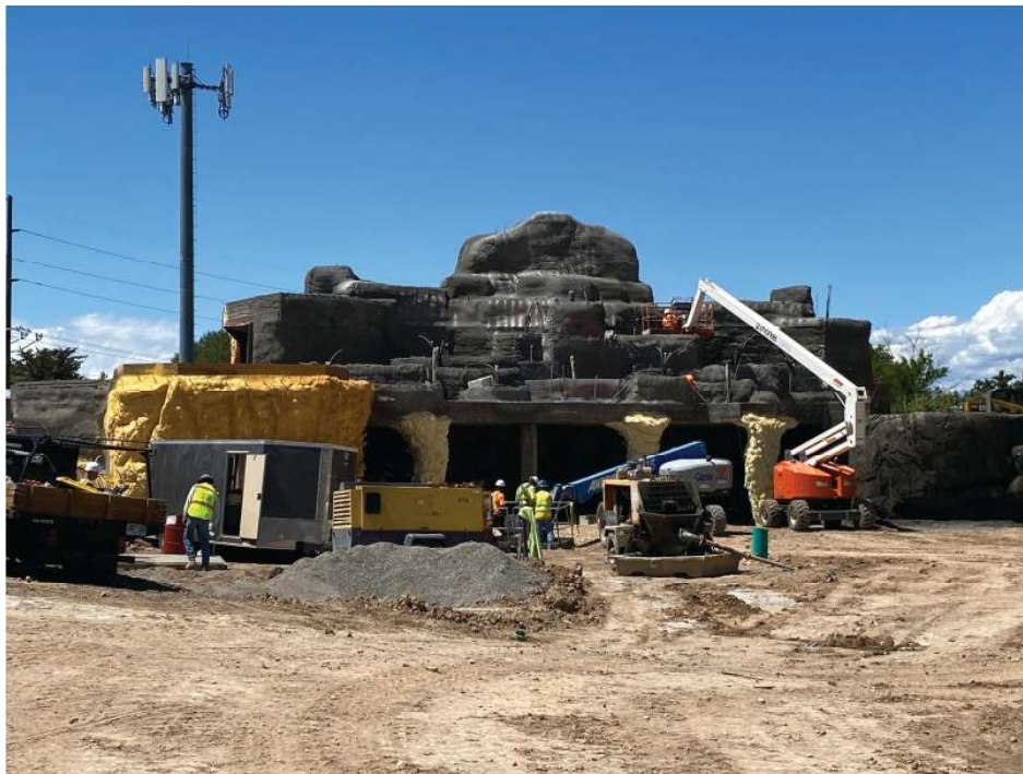
Figure 7 Concrete aquatic structures

The Central 70 project on the Interstate Highway I-70 in Denver, Colorado that commenced in late 2018 (see Eden announcement (ASX:EDE) 15 November 2018) and is still continuing, in which EdenCrete® is being used