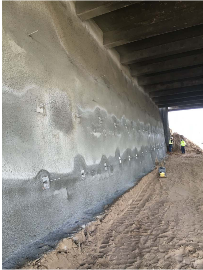
Figure 10. Retaining wall constructed under bridge using EdenCrete® on Central 70 project.

As a result of the significant benefits delivered on the Central 70 project, Eden anticipates that EdenCrete® will be likely to be included in a considerable number of future projects.