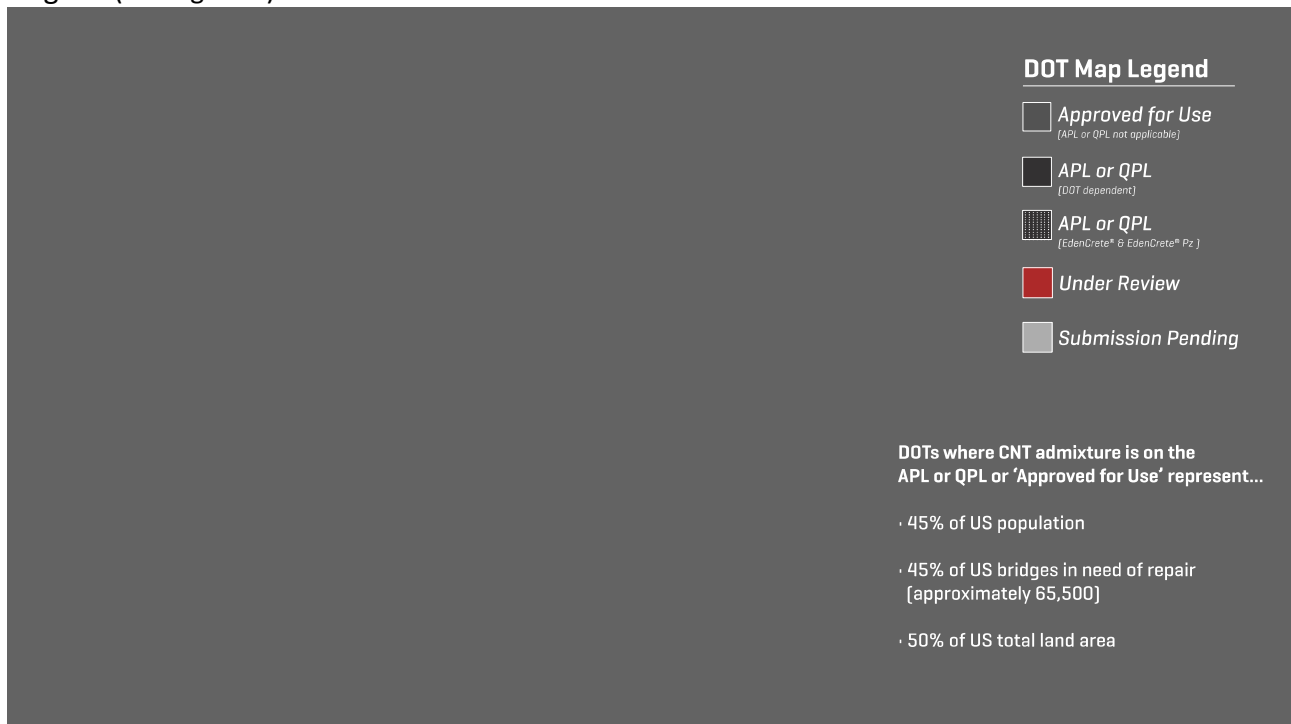
Figure 1. Current Status of US DOT Approvals of EdenCrete® Products

Alabama, Alaska, Arkansas, California, Colorado, Georgia, Kentucky, Louisiana, Mississippi, North Carolina, Oklahoma, Oregon, South Carolina, Tennessee, Texas, Vermont, Virginia and West Virginia (see Figure 1).