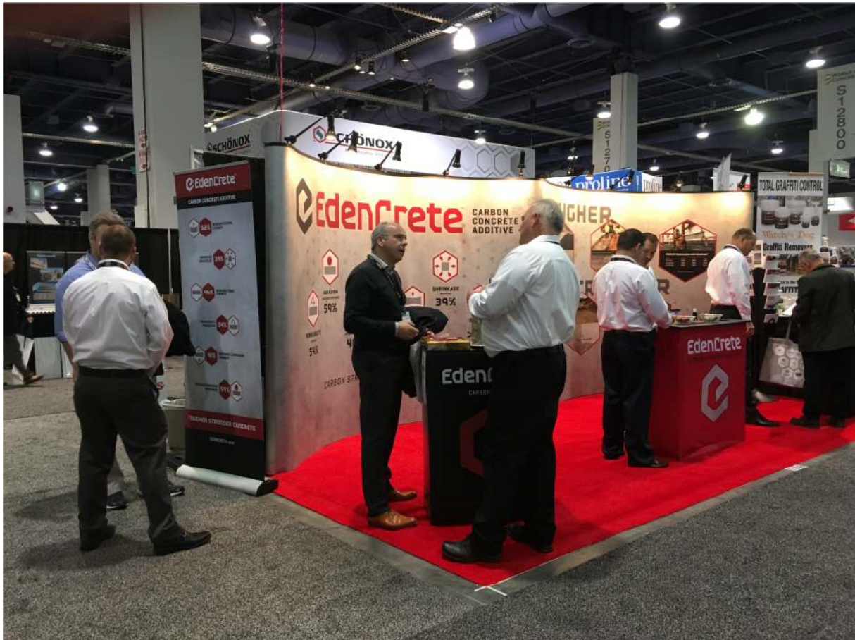
Figure 1. Eden's sales team answer questions

The EdenCrete™ booth at the World of Concrete (WOC) ( https://worldofconcrete.com ), in Las Vegas (previously announced (ASX:EDE – 18 January 2017)) attracted a significant amount of interest (see Figure 1 below) and had many visitors.