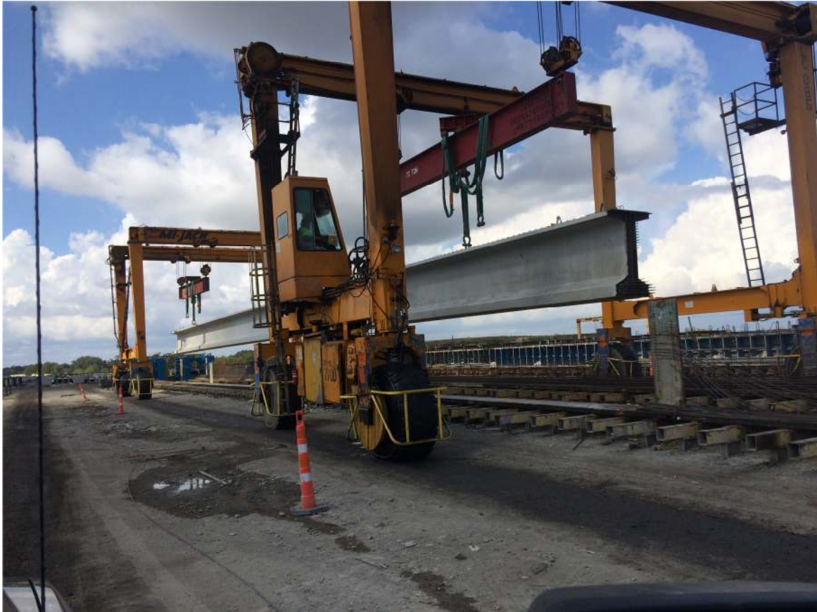
Figure 1. Typical Precast / prestressed bridge beam being fabricated

The precast concrete market represents a large portion of the total US concrete market, and this may rise due to the focus of US President – Elect Trump on improving infrastructure.